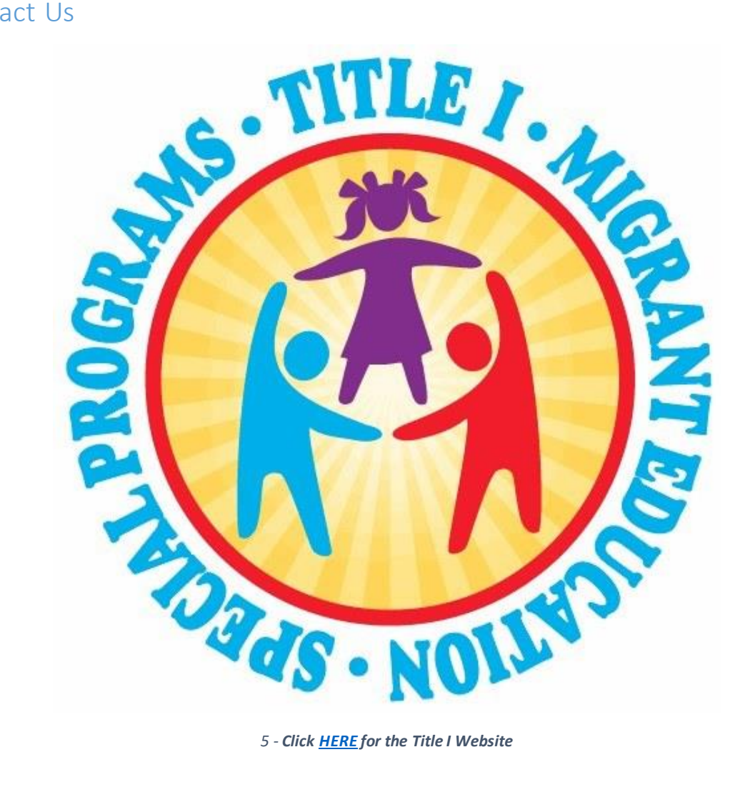
5 - Click <u>HERE</u> for the Title I Website