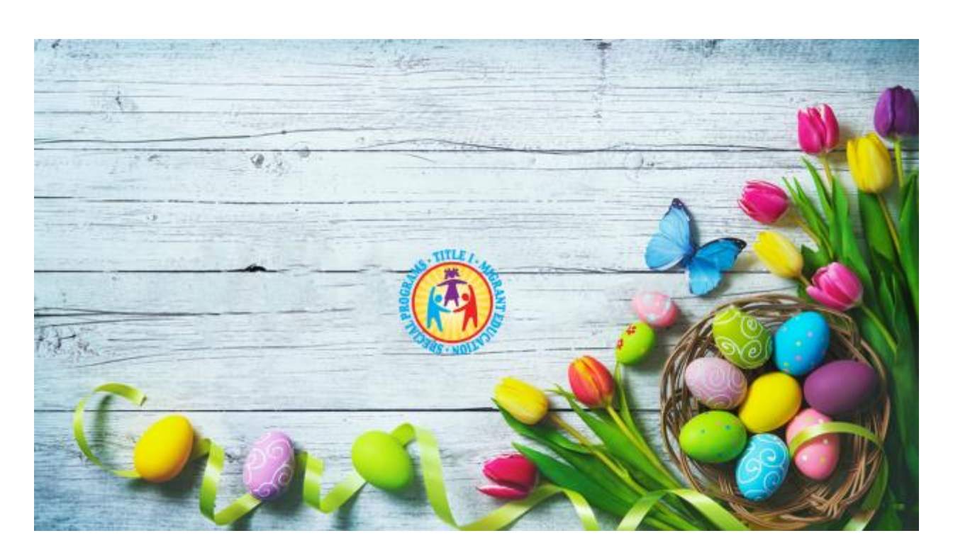
Title I, Migrant and Special Programs April 2019 Newsletter